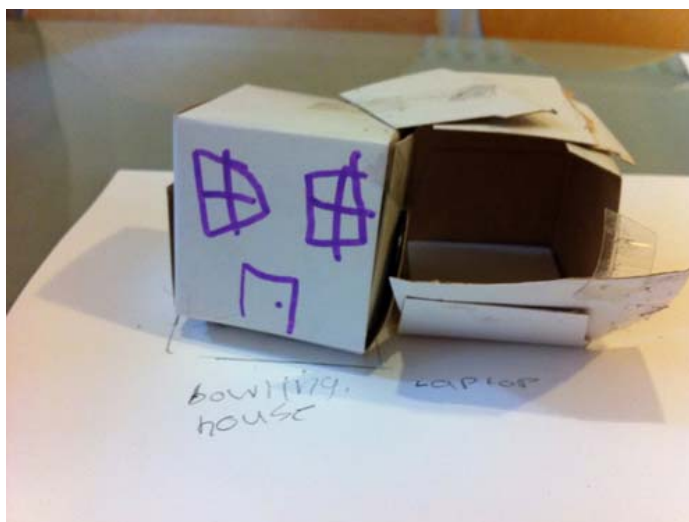
Some of the schoolchildren's ideas and models for the bowling club