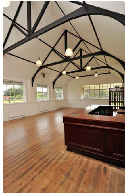
Before and after renovation

On a lighter - but no less important - note, during the uncompromisingly wet summer and ignoring alarming weather forecasts, a great family day was organized in June with street-theatre, entertainment, music and barbecues. On several occasions the site has proved now to be a magnet for the best kinds of family entertainment; as a safe, green site with excellent wet-weather provision I cannot think of anywhere better. One of my greatest pleasures this year has been watching families enjoying the wide open space and safety of the greens, knowing that these are now theirs in perpetuity.